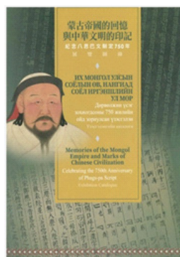
Published in July 2019 ISBN 9789576786686

This book is the catalogue for an exhibition held in Ulaanbaatar. The exhibits can be roughly