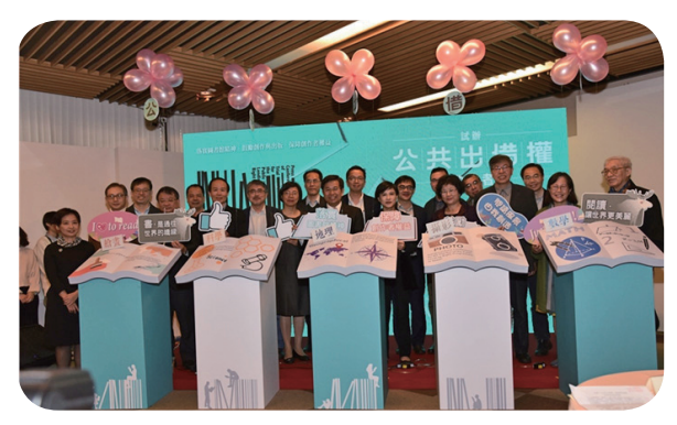
A group photo of dignitaries in attendance at press conference.

On December 31, 2019, the Ministry of Education and the Ministry of Culture held a press conference, hosted by National Central Library, on a Trial Implementation of Public Lending Right. It was held at NCL's exhibition hall. In attendance were those who had given input into and helped develop the trial system, such as scholars, publishers, and representative authors, representatives from the library association, officials from local departments of cultural affairs, and personnel from public libraries. It also attracted the attention of media representatives from almost 20 different organizations.