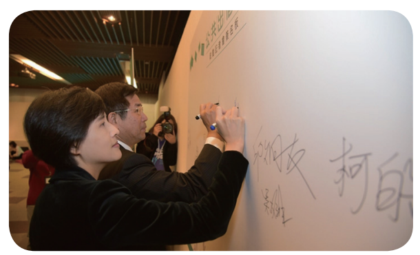
Minister of Education Wen-Zhong Pan and Minister of Culture Li-chiun Cheng sign their names during the press conference to commemorate the occasion.

After the press conference, the two ministers and those in attendance participated in an opening ceremony marking the kick-off of the new initiative. Dignitaries used five watering cans to water five large books. As they were watered, five flowers grew out of the books, symbolizing the gestation and fruition of Public Lending Right in Taiwan. By raising Public Lending Right to the status of a national government policy, it achieves the three aims of realizing the spirit of libraries, encouraging creative works and publishing, and ensuring the rights of creators.