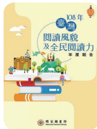
Published in February 2020 ISBN 9789576786808

and city libraries to understand the reading ability, habits, and interests of the Taiwan public. In an effort to actively support libraries and publishers in Taiwan and to keep abreast of reading needs by patrons, patron records of borrowing books were analyzed to show the popular books this last year, thus providing libraries and publishers with information on reading tastes. This data can be used in promoting reading, in acquisitions, and for publishers to use in determining the direction of future publications.