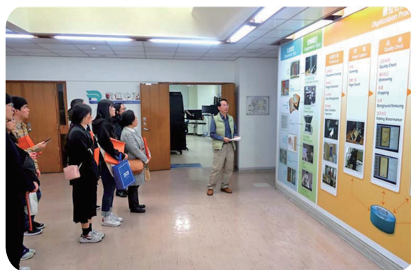
The delegation visit the NCL's Digital Center.

After seeing the Digital Center and its scanning equipment, Rare Books Room, and Contemporary Celebrities Manuscripts system, the visitors then discussed issues with them such as the size of the collection, digital services, and different types of reader. The visiting delegation said that they were deeply impressed by the NCL's collection of antique books and documents.