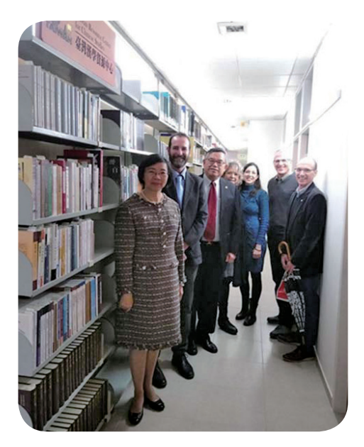
A group photo at the Taiwan Resource Center for Chinese Studies after unveiling its official plaque.