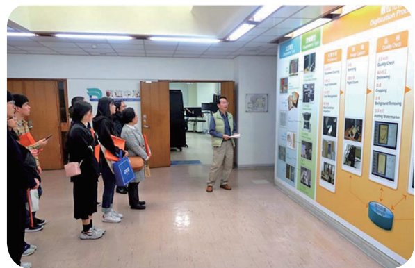
The delegation visit the NCL's Digital Center.

After seeing the Digital Center and its scanning equipment, Rare Books Room, and Contemporary Celebrities Manuscripts system, the visitors then discussed issues with them such as the size of the collection, digital services, and different types of reader. The visiting delegation said that they were deeply impressed by the NCL's collection of antique books and documents.