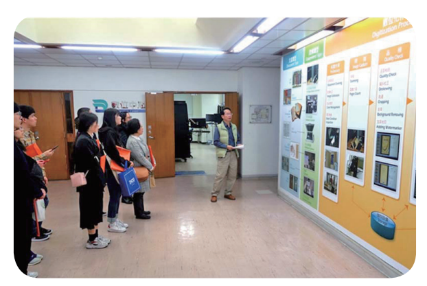
The delegation visit the NCL's Digital Center.

After seeing the Digital Center and its scanning equipment, Rare Books Room, and Contemporary Celebrities Manuscripts system, the visitors then discussed issues with them such as the size of the collection, digital services, and different types of reader. The visiting delegation said that they were deeply impressed by the NCL's collection of antique books and documents.