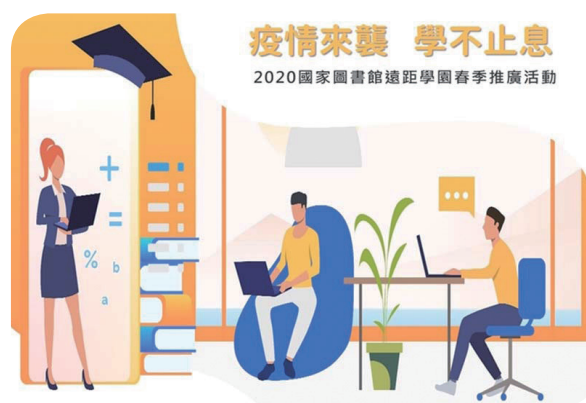
The promotional poster for the Spring Digital Learning courses.

» NCL E-Learning Campus platform: https://cu.ncl.edu.tw/mooc/index.php