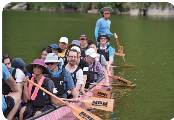
Foreign scholars experience rowing dragon boats on the Dragon Boat Festival.