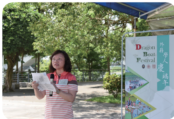
Deputy Director-General Ying-mei Wu welcomes everyone to the event.

the scholars could enjoy the beautiful scenery of Bitan while they experienced a rare chance to race dragon boats. During the event, pandemic-prevention protocols were followed, the same ones that were followed during the recent official dragon boat race in Taipei. While groups were practicing on the shore, they all wore facemasks; their temperatures were also taken and their hands cleansed with rubbing alcohol. After the practice session was over the groups raced against each other and also played dragon boat tug-of-war. All were rowing with their might, following the cheers coming from the shore. With such a festival atmosphere, they were very impressed with this traditional activity and can now take Taiwan's new forms of exercise during the pandemic back to tell people in their home countries.