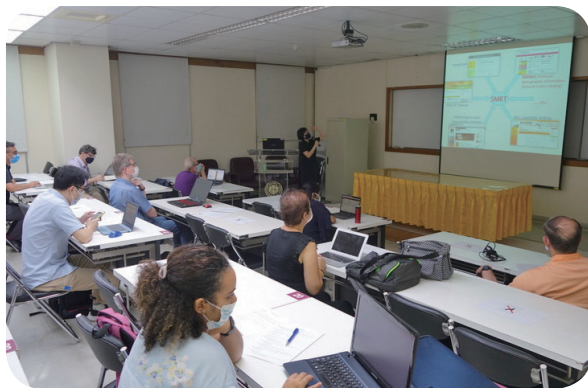
Visiting foreign scholars listen to the “Using library resources course”.

indoor activity was also held in accordance to COVID-19 prevention measures.