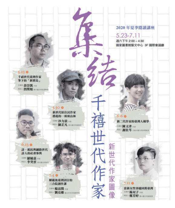
2020 Summer Reading lecture series poster.

The themes of the six sessions were "The New Island in the Writings of Taiwan Millennial Authors," "Mountain Forests on the Backs of New Aboriginal Authors," "Taiwan Ethnology in Writings of New 2nd Generation Authors," "Poetry, Resistance, and the Internet Generation Poets' Social Participation," "Sanheyuan Creative Writing Classes for Children Born after 1987," "When the New Woman Passes through to Old Taiwan."