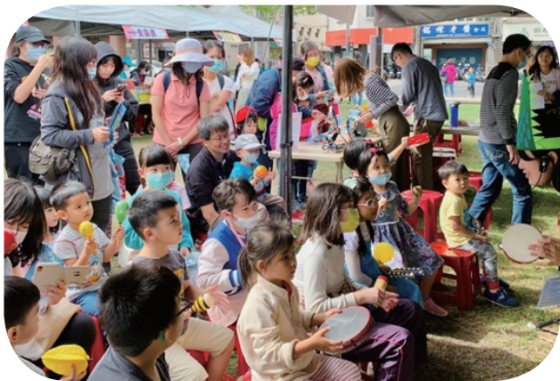
Children participate in “Reading is Cool Carnival” stall activities.

Schools plan for junior high and elementary school students, bought 600 award-winning English books, and custom-made exclusive bookshelves to donate to six junior high and elementary schools in Hsinchu County and Hsinchu City.