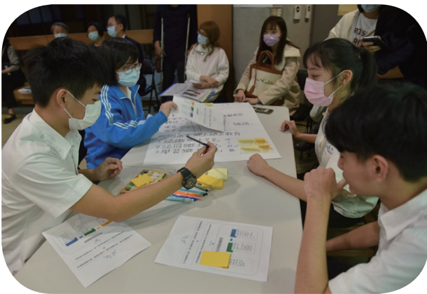
Students participate in a teaching demonstration and subsequent discussion.

Next, if one touches the lunchbox on the desk or opens the book bag they will hear music playing. A total of 12 songs were collected from the three historical periods. If the desk drawers are opened, the screen will show textbook images from the three periods that can be written on. The exhibition also has a corresponding book exhibition, displaying the history of various publishers and Chinese textbooks from after modern textbooks were made available.