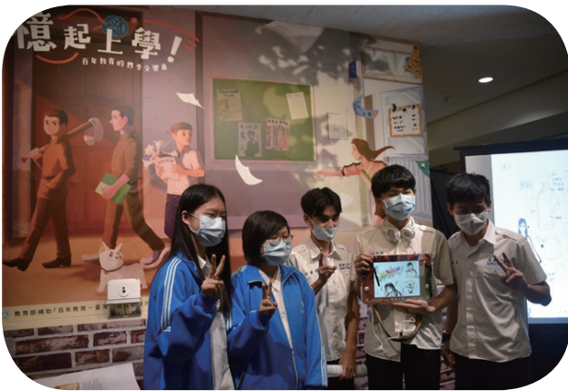
Students experience immersive AR exploration.

classroom bulletin board. If one touches the wall, a clock on top of the wall will start to turn and on the wall will appear the results of NCL and 100 year old high schools (including Taipei Municipal Chenggong High School, National Tainan Girls' Senior High School, and Pingtung Girls' High School) collaboration on digitizing historical items.