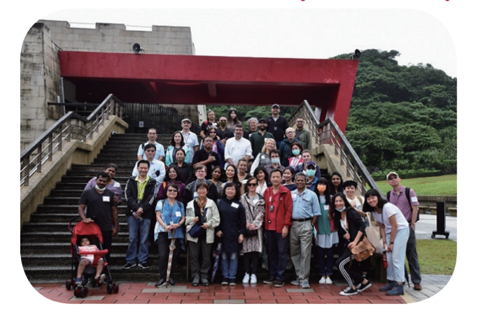
A group photo at Heping Island Park.

■ NCL Invites Foreign Scholars on a Cultural Excursion to Experience Taiwan's Natural Beauty and Diversity