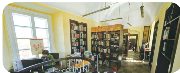
The TRCCS will be located at the Oriental Studies Reading Room at the 4th and 5th Floor of the Central Library of Vilnius University.

The cooperative relationship between NCL and all the TRCCS partners is committed to long-term sustainable and mutually beneficial cooperation. Both parties agreed and promised in the signed Cooperation Agreement that while NCL will share good-quality academic monographs and digital resources when possible, the VU will assist the NCL to get most up-to-date information concerning Taiwan and Sinology research publications in the country, and will also collaboratively hold topical lecture and exhibition. This is of mutual beneficial for both parties. The NCL appreciates that the jointly held topical lectures with TRCCS partners allows outstanding Taiwan scholars to show and share their researches for international academic communities, and the NCL is also possible to collect local publication information, and even further cooperation projects such as cooperation digitization of ancient books became possible. It is well recognized as a model project for successful academic exchanges.