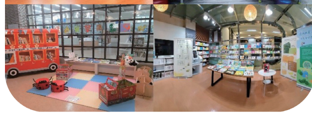
Photographs of the exhibition halls of 3rd touring exhibitions (from left to right: Penghu, Hualien, Taipei, Taichung).