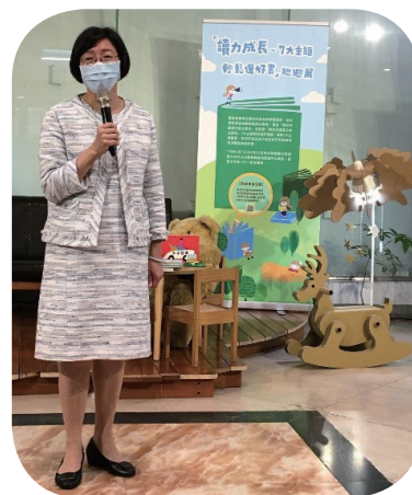
On April 7, 2021, NCL Director-General Tseng delivers remarks at the opening ceremony.

and to make effective use of the content of thematic picture books to enhance children's learning and subtly trigger their creativity and expression ability, the NCL established the Website of Easy Selection of Infant Age-based Themed Books ( https://isp.ncl.edu.tw/infant-promote ) and planned for the associated touring exhibition between April and June 2021. This exhibition was conducted jointly with the regional resource centers of 12 public libraries. The activity mainly consisted of two parts, the first of which was the thematic book exhibition. The exhibition was curated by the collaborating libraries which tried to use more than 300 books believed to be related to the growth and learning steps of infants, carefully selected from the "Good Books Website" ( haoshuya.com ) by parents. The second part was a voting activity for the favorite library, inviting readers attending the exhibition to visit the voting website and vote for their favorite exhibition. The purpose of this voting activity was to find out the reliability of librarians' book selection. From the voting result librarians can reconsider about if their book selections were adequate enough to meet parents' needs, thereby reduce the gap between the librarians and parents.