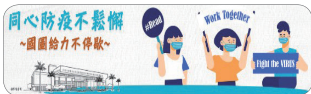
"Working together to fight the pandemic" poster.

NCL's Reading Is Power website: https://isp.ncl.edu.tw/site-readingispower