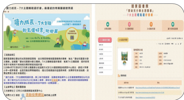
The Easy Selection of Infant Age-based Themed Books on Seven Major Themes for Reading Ability Growth touring exhibition webpage.

Reading intimately with parents from young age, children could learn that reading is a happy affair and have it become a habitual thing in their lives. It is sure that reading habit is cultivated from young age. Although the touring exhibition has already finished, information about it and themed books can still be found on the mentioned Website. Through this touring exhibition, the Infant Books Age Classification Theme Table was promoted to county and city libraries, and has become known to more readers and could serve as a reference tool for selection of good books. We hope that children will develop reading habit through reading with their parents, henceforth could embark on a rich and enjoyable reading journey in the future.