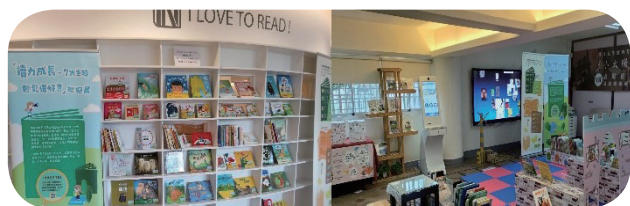
Photographs of the exhibition halls of the 1st touring exhibitions (from left to right: Tainan, Yunlin, New Taipei City, Taitung).