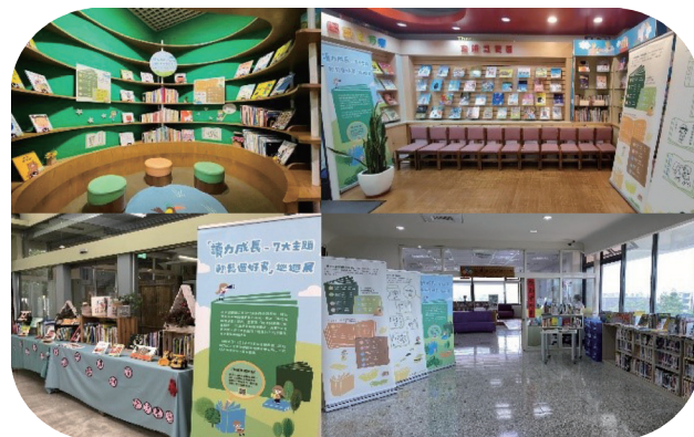
Photographs of the exhibition halls of 2nd touring exhibitions (from left to right: Kaohsiung, Taoyuan, Yilan, Miaoli).