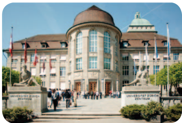
The main gate of the UZH main building.

higher learning in the Times Higher Education World University Rankings. This makes UZH remain the best-ranked comprehensive university in Switzerland and well-known abroad. The TRCCS cooperation project will benefit the faculty and students of the Institute of Asian and Oriental Studies the most. The beginnings of this institute could be traced back to 1950 when the Switzerland government became aware of the importance of China Studies and started to set up Chinese and Japanese language education programs at the University of Zurich. The education and research scope then extended to cover Korea and East Asian studies, and gradually formed a more comprehensive Institute of Asian and Oriental Studies at the UZH.