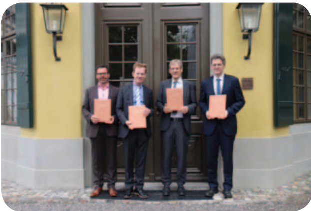
Group photo of the four representatives of UZH signing the TRCCS Cooperation Agreement.