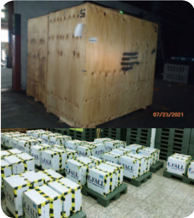
Two large wooden boxes of books arrive in Keelung on July 23, the books arrive at NCL on August 2.