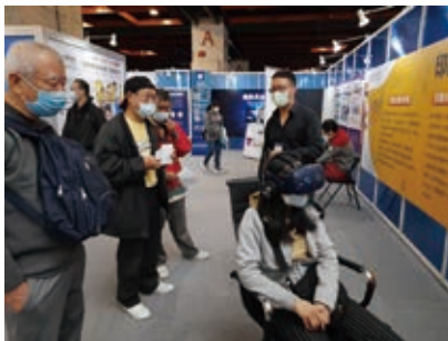
「印象太陽 VR」獲 2020 資訊月主題館邀請設展，於 12 月 2 日至 6 日展覽期間提供民眾體驗文學的精彩。

The 2020 Information Technology Month organizer invited the NCL to set up VR Impression of the Sun exhibit in the theme pavilion during December 2 to 6 to give the public a window into the world of a literary work.