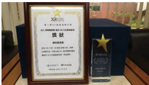
本館「印象太陽 VR」榮獲「第一屆 XR 創星金點大賞」B2C 消費體驗類最佳 XR 文化藝術應用獎

2020 資訊月主辦單位，特邀本館「印象太陽 VR」於主題館中設展，12 月 2 日至 6 日展覽期間，多位年長民眾體驗後，對 VR 裡考究的年代氛圍營造相當感動；更有多位數位工作者讚賞「印象太陽 VR」為近年來最為細膩精緻的文學 VR 作品；「印象太陽 VR」在資訊月現場，也成為青少年爭相要尋找「埋了很多彩蛋」的歡樂時空機。