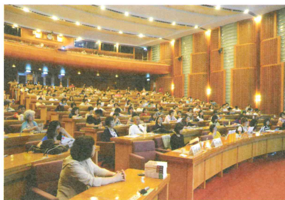
Reading Promotion Activity: Literature and Movies in Taiwan.

The Center conducted “Literature and Movies in Taiwan,” a reading promotion activity from May 19 to July 18, 2012, and invited the re-known and popular domestic writers and scholars to lecture, appreciate, and analyze the representative works of seven major categories of novels, i.e., female, great river, local, staff’s village, illustration and text, web, and history, while focusing on the topic of “Taiwanese Novels.” Reading activity also ran the movies that were adapted from the same novels. It’s hope that the audience would be able to have a better and more understanding of the creativity and implications of Taiwanese literature by way of different types of presentation.