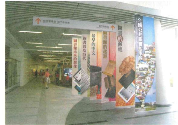
The Digital Experience Center

services of 520 public libraries in Taiwan. There is also a diverse way to display the development of Chinese characters, the change of the media of Chinese books over five thousand years and the future of cloud public libraries.