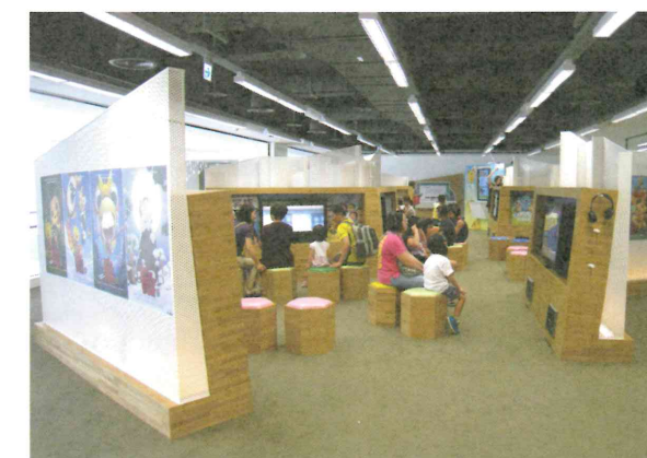
The Digital Leisure Center

In order to create a national-level digital public library, National Taichung Library (NTL) inaugurated in June this year and recently further opened to the public the "Digital Leisure Center," "Digital Art Center" and "Digital Experience Center." The "Digital Leisure Center" presents the works of fifteen Taiwan local animation companies, highlighting Taiwan's original spirit. The "Digital Art Center" brings together outstanding digital creative works created by university students in Taiwan through the platform of Digital Art Gallery. It also features a digital audio and video collection database.