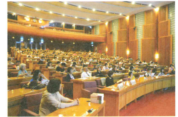
Reading Promotion Activity: Literature and Movies in Taiwan.

The Center conducted “Literature and Movies in Taiwan,” a reading promotion activity from May 19 to July 18, 2012, and invited the re-known and popular domestic writers and scholars to lecture, appreciate, and analyze the representative works of seven major categories of novels, i.e., female, great river, local, staff’s village, illustration and text, web, and history, while focusing on the topic of “Taiwanese Novels.” Reading activity also ran the movies that were adapted from the same novels. It’s hope that the audience would be able to have a better and more understanding of the creativity and implications of Taiwanese literature by way of different types of presentation.