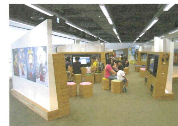
The Digital Leisure Center

In order to create a national-level digital public library, National Taichung Library (NTL) inaugurated in June this year and recently further opened to the public the "Digital Leisure Center," "Digital Art Center" and "Digital Experience Center." The "Digital Leisure Center" presents the works of fifteen Taiwan local animation companies, highlighting Taiwan's original spirit. The "Digital Art Center" brings together outstanding digital creative works created by university students in Taiwan through the platform of Digital Art Gallery. It also features a digital audio and video collection database.