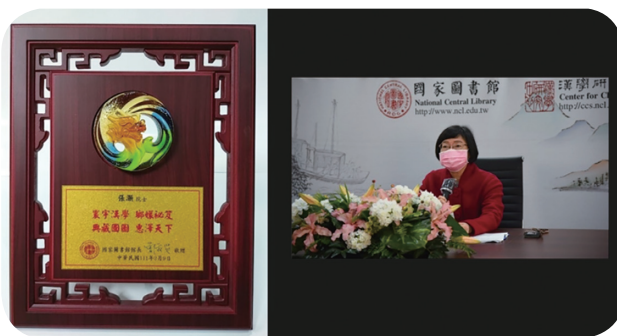
National Central Library presents a plaque of appreciation.