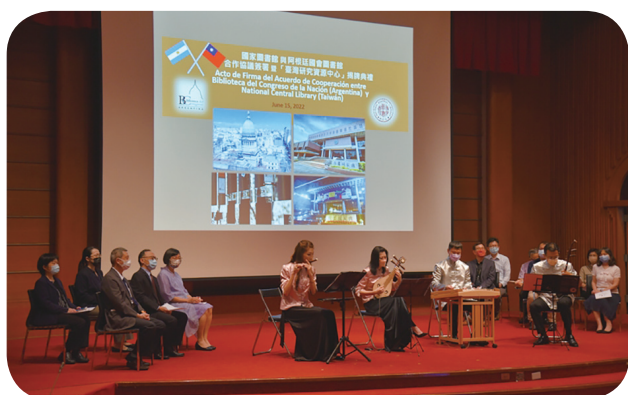
NCL arranges for a string music performance of Taiwan folksongs.