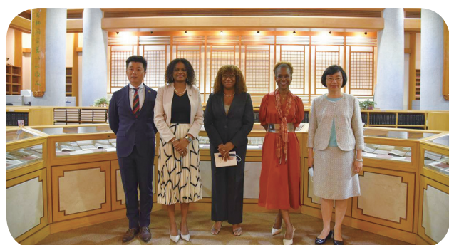
Group photo in the rare books room after touring at the conservation room that preserves the national treasures.

The ambassadors were deeply impressed with NCL's rich scholarly resources and special collections. It is also hoped that the forum will lead to smoother future collaborations between all parties, as well as provide even more opportunities for exchanges. Thereby, the good collaborative relations would bring about expected fruitful results.