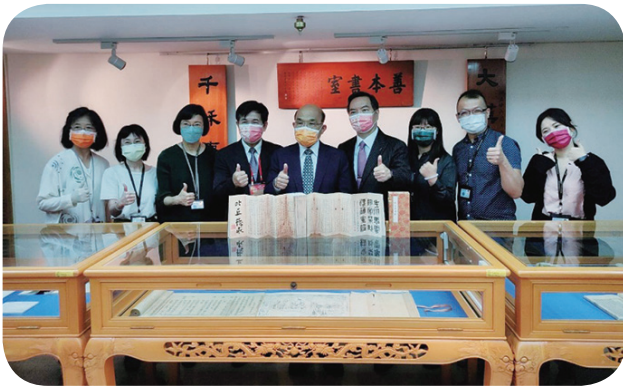
A group photo of Premier of the Executive Yuan Tseng-chang Su, Minister without Portfolio Bing-cheng Lo, Minister of Education Wen-chung Pan, and Minister of Finance Jain-rong Su in the special collections vault.