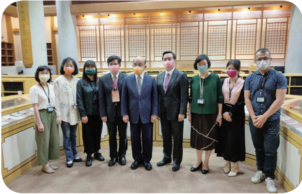
A group photo of Premier of the Executive Yuan Tseng-chang Su, Minister without Portfolio Bing-cheng Lo, Minister of Education Wen-chung Pan, and Minister of Finance Jain-rong Su in the Rare Books Room.