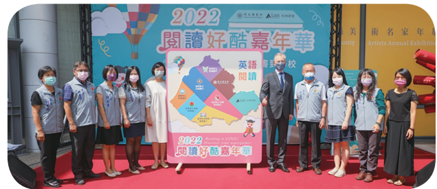
The opening ceremony of the 2022 Reading Is Cool Carnival.

NCL and Lam Research Corporation teamed up again this year to host an English reading promotion event targeted at junior high and elementary school students, where books were donated to their schools. In an effort to increase the effectiveness of the donations, the scope of schools receiving donations was expanded from Hsinchu to Miaoli County, allowing more remote schools the opportunity to receive reading resources. The Book Donations to Schools project purchased 600 award winning English books and customized bookshelves for them, and donated these to six elementary and junior high schools in Miaoli County. An English Reading Center was created in each school to stimulate students' motivation to learn English and to increase interest and success in learning. At the end of the activity, special thanks were delivered to the Miaoli County government, its Education Department, and Culture and Tourism Bureau for their assistance in organizing this event. Also, to Gongguan Junior High, National United University Library, and 17 other institutions and companies for their amazing booths and activities.