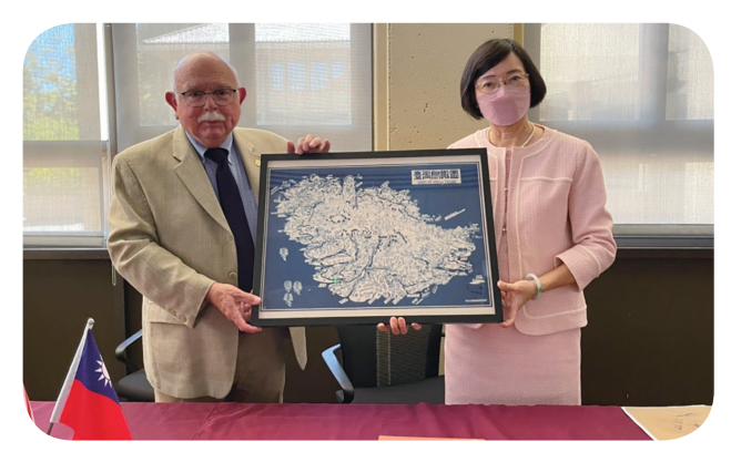
Stanford University Library gifted NCL a bird's-eye-view old map of Taiwan.