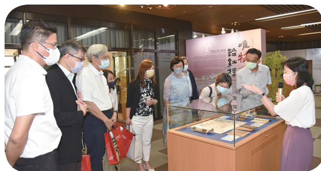
During an exhibition tour.

NCL Director-General Shu-hsien Tseng stated, as one of the important repository for printed material, NCL has in its collection many ancient books on the Dream of the Red Chamber ( Honglou Meng ) and on Redology. This exhibition dovetails with our fall reading lecture on Dream of the Red Chamber ( Honglou Meng ) and highlights various people or things in the novel. On display are more than 50 rare books and items from NCL’s collection. These are of different genres, various writing styles, and represent variegated content, making them very much worth a look. In addition, the design of the exhibition space was aimed to produce a specific atmosphere by replicating Cao Xueqin’s “big showcase” of a land of immortals. So that while visitors were admiring the elegant ancient books, they could also have the feeling of wandering about gentrified courtyard of an aristocratic and literary family. Also, in conjunction with the five main themes of the exhibition and the fall season, a Lantern Festival riddle game and a bookmark making station were on hand so that visitors could experience and better understand abundance of wisdom found in the daily life described in this great classic work. Visitors could then have a sense of the magnificent spectacle and age that is in this book, as well as the insights and feelings it can awaken us from so long ago.