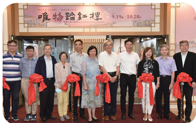
Dignitaries at the ribbon cutting for the exhibition “Materialism showed in the Dream of the Red Chamber (Honglou Meng)”: A Special Exhibition of Rare Books on Honglou Meng.”

NCL selected September, that wonderful time when fall is in the air, to hold the exhibition “Materialism showed in the Dream of the Red Chamber ( Honglou Meng )”: A Special Exhibition of Rare Books on Honglou Meng .” There were about 50 rare books in NCL’s collection that are on Dream of the Red Chamber ( Honglou Meng ) or that deal with Redology selected. They were divided into five main categories: characters in the novel, medicine, food and feasts, plants used as metaphors for emotions, and tools and implements. The aim was to create a shortcut for the public to engage in reading by helping them become familiar with different aspects of the novel to guide the study of this story. In addition to being able to appreciate Cao Xueqin’s material aesthetics that he spent much time crafting in the novel and rekindling a feeling for this classic, NCL wanted to help the public to become more literate and to nourish their mind and heart.