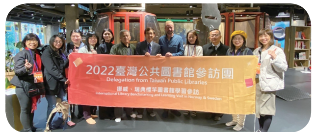
Members of the 2022 Taiwan Public Library Benchmark Study Group at Biblo Toyen Library.