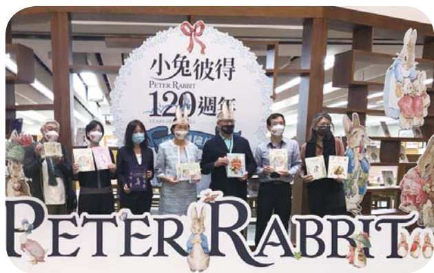
A commemorative photo with esteemed guests at the Peter Rabbit exhibition.