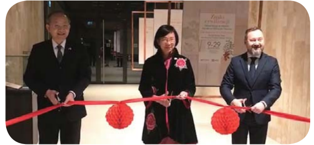
The ribbon cutting ceremony of The Imprint of Civilization: Ancient Books from the National Central Library, Taiwan at the National Library of Poland.

The opening ceremony of the exhibition and the lecture attracted many people. The exquisite design of the exhibition and the sheer number of items on display surprised the Polish public. The Chinese New Year picture stamps and the auspicious stamp making activity was popular among visitors. To augment the content of the exhibition and the interaction of those in attendance, an interactive electronic postcard station was set up to provide visitors a chance to take a picture with a special background and then turn it into a postcard. The opening ceremony attracted many special guests, who were eager to experience the digital options in the exhibition.