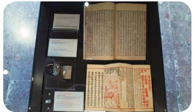
Replica copies of rare ancient books from NCL on display at the exhibition.