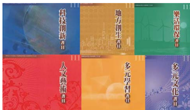
Published in December 2022