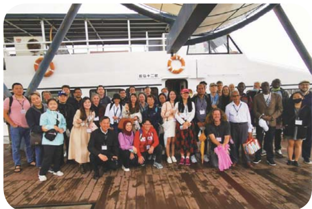
National Central Library holds cultural visits for foreign scholars.