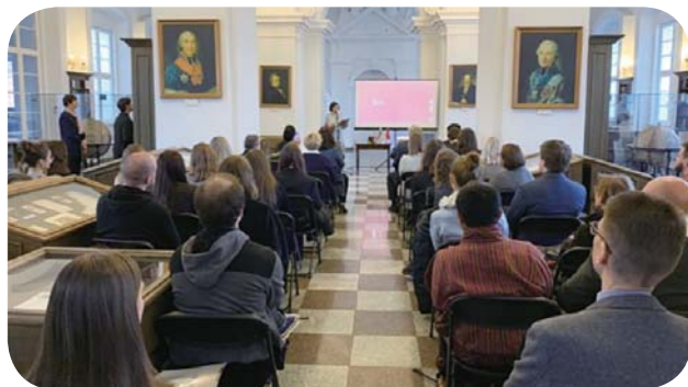
University library staff and the East Asian Studies Department faculty and students attending the opening ceremony.