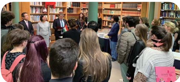
Staff from the ELU Library and East Asian and Asian Studies faculty and students at the signing ceremony.