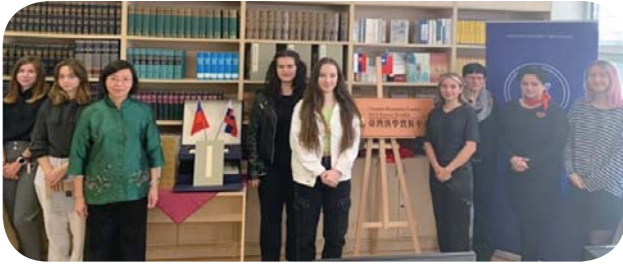
Staff from the Comenius University Library and faculty and students in East Asian Studies attended the TRCCS opening ceremony.