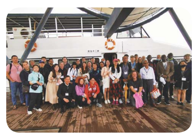
National Central Library holds cultural visits for foreign scholars.