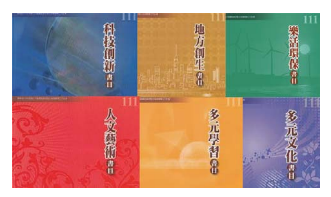
Published in December 2022

1. Scientific and Technological Innovation Booklist 2022