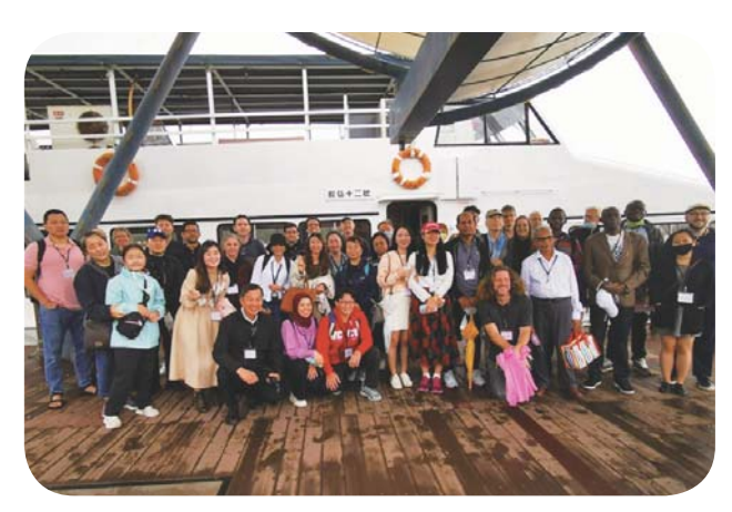
National Central Library holds cultural visits for foreign scholars.