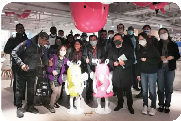
Group photo of foreign scholars at the entrance to OPEN LAB.

First of all, colleagues from OPEN LAB guided the students in using the center's space and introduced the process of booking various facilities, the reading space for various creative books, discussion rooms, recording and broadcasting rooms, creative experiment spaces, etc. After the tour, and in groups, the students experienced hand-craft experience courses, involving sewing machines, mug heat transfer printing, and badge machines. At the same time, OPEN LAB's other equipment and reading space prompted scholars to stop, visit and learn more about center colleagues. This activity was the first for the scholars in 2023. There were 20 scholars from 14 countries. They participated enthusiastically and said that they would make more use of the functions and space of this center.