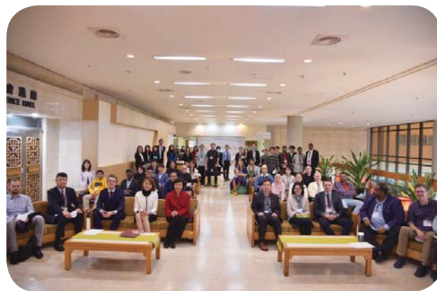
Group photo of 2023 Chinese New Year Exchange Tea Party for Foreign Visiting Scholars.

Reception for Visiting Scholars in the Breezeway on the 3rd floor of the Art Center at noon on February 8, inviting 41 Ministry of Foreign Affairs Taiwan scholars and their spouses, six Center for Chinese Studies scholars and their spouses, 15 officials and distinguished guests from the Department of Policy Planning of the Ministry of Foreign Affairs, and more than 70 colleagues from the National Central Library, totaling more than 70 scholars, all under the same roof as the year got underway. Interacting with conversation while savoring culinary delights, they shared their research experiences in Taiwan.