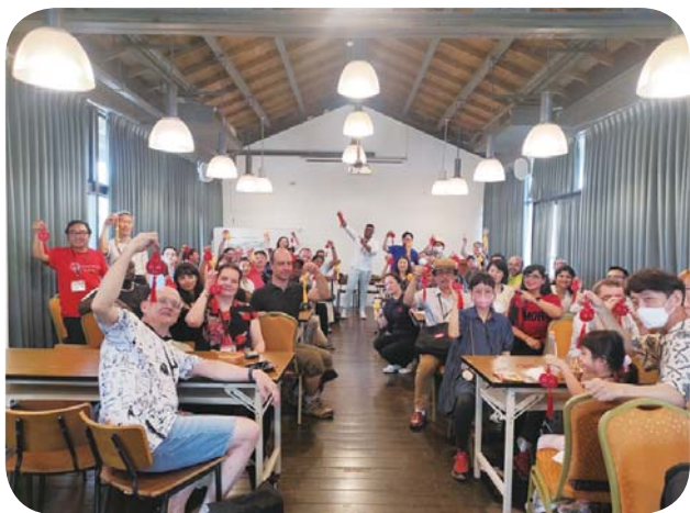
Scholars make incense bags for the Dragon Boat Festival.

this event as a means to enable these scholars in Taiwan to project Taiwan’s cultural allure onto the international stage. We extend a warm invitation for their return to Taiwan, to become an integral part of our community, and to immerse themselves in the vivacity of Taiwan’s cultural tapestry.”