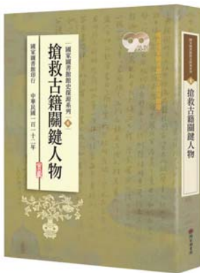
Published in April 2023 ISBN 9789576787348

Salvaging Key Ancient Figures collects the biographies of 14 patriots and sages who participated in the task of rescuing ancient books and protecting national literature during the Sino-Japanese War of Resistance. The characters are demarcated by three places, namely Chongqing, Shanghai, and Hong Kong, depending on their tasks or where they lived. Content narratives include images of people, their biographies, important positions and experiences, participation in the process of salvaging ancient books and their specific contributions, and texts are accompanied by historical National Central Library documents, newspapers, and manuscripts of related books or graphical data. We hope to commemorate the achievements of these cultural patriots, and commend the heroic behavior and honor they showed in saving rare ancient books and documents and preserving the lifeline of culture during a difficult time for the country.