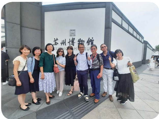
The Taiwan delegation poses in front of the Suzhou Museum.

On the 25 th , the delegation attended “Rosy Clouds Reflect the World, A Long-Standing Flow: An Exhibition of Ancient Books and Paintings from the Guoyunlou Collection” put on by the Nanjing Library (the Jiangsu Provincial Center for the Preservation of Ancient Books), the Gu Clan in Suzhou that curates the Guoyunlou Collection, and the Phoenix Publishing and Media Group. On display were the best of the three institutions' collections. The delegation also visited Nanjing Library's Ancient Book Preservation Department.