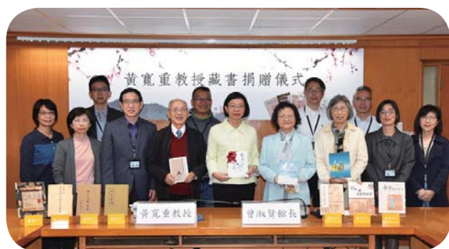
A perfect ending to the donation ceremony (a group photo).