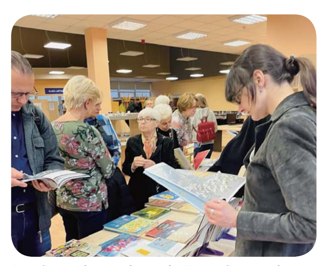
Riga City residents reading in the Taiwan Corner and getting to know Taiwan.

The mission of Riga Central Library is to provide safe and reliable information in order to ensure free and equal access, support education and lifelong learning, develop reading skills, digital and media literacy, promote a societal interest in literature and reading, and advocate the protection of local cultural heritage, while at the same time developing the library as a "third space" —a free and open space for communities to gather, where individuals can transcend the traditional living spaces of the home and the workplace to engage in social interactions. These concepts align with the development of many Taiwan public libraries in recent years, demonstrating the trajectory of the role of libraries within these two free and democratic systems. These joint ideals serve as a beneficial foundation for ongoing bilateral cultural exchange.