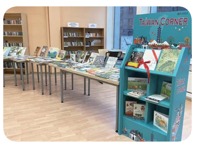
Riga Central Library displays the Taiwan Corner in a large open section of the library.

The mission of Riga Central Library is to provide safe and reliable information in order to ensure free and equal access, support education and lifelong learning, develop reading skills, digital and media literacy, promote a societal interest in literature and reading, and advocate the protection of local cultural heritage, while at the same time developing the library as a "third space" —a free and open space for communities to gather, where individuals can transcend the traditional living spaces of the home and the workplace to engage in social interactions. These concepts align with the development of many Taiwan public libraries in recent years, demonstrating the trajectory of the role of libraries within these two free and democratic systems. These joint ideals serve as a beneficial foundation for ongoing bilateral cultural exchange.