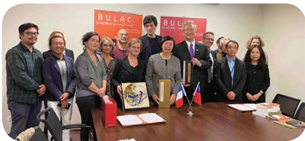
A group photo of NCL and BULAC signing an agreement to establish a Taiwan Academic Digital Resource Center.

Lastly, to commemorate this collaboration, NCL gifted two classics to the library—a replica copy of the 800-year-old book The Annotated Poetry of Su Dongpo (a national treasure) and the Diamond Sutra . It was hoped that this donation would add to the collection at BULAC, as well as witness the historical nature of this collaboration. They will also provide more opportunities for collaboration in the future.