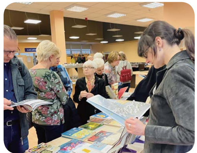
Riga City residents reading in the Taiwan Corner and getting to know Taiwan.

The mission of Riga Central Library is to provide safe and reliable information in order to ensure free and equal access, support education and lifelong learning, develop reading skills, digital and media literacy, promote a societal interest in literature and reading, and advocate the protection of local cultural heritage, while at the same time developing the library as a "third space" —a free and open space for communities to gather, where individuals can transcend the traditional living spaces of the home and the workplace to engage in social interactions. These concepts align with the development of many Taiwan public libraries in recent years, demonstrating the trajectory of the role of libraries within these two free and democratic systems. These joint ideals serve as a beneficial foundation for ongoing bilateral cultural exchange.