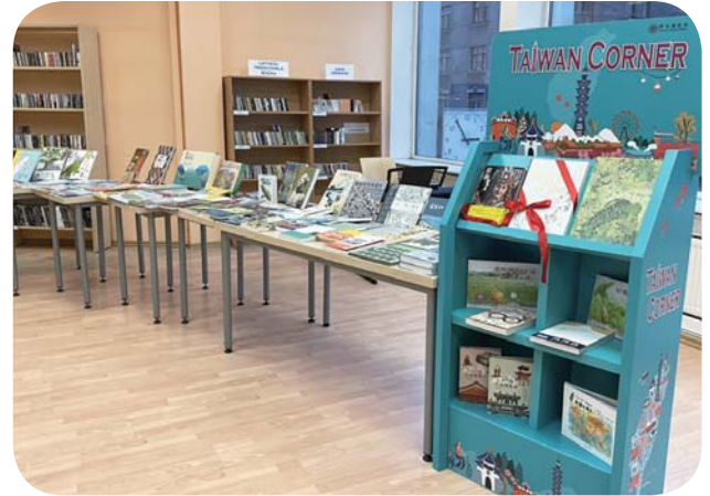
Riga Central Library displays the Taiwan Corner in a large open section of the library.

The mission of Riga Central Library is to provide safe and reliable information in order to ensure free and equal access, support education and lifelong learning, develop reading skills, digital and media literacy, promote a societal interest in literature and reading, and advocate the protection of local cultural heritage, while at the same time developing the library as a "third space" —a free and open space for communities to gather, where individuals can transcend the traditional living spaces of the home and the workplace to engage in social interactions. These concepts align with the development of many Taiwan public libraries in recent years, demonstrating the trajectory of the role of libraries within these two free and democratic systems. These joint ideals serve as a beneficial foundation for ongoing bilateral cultural exchange.