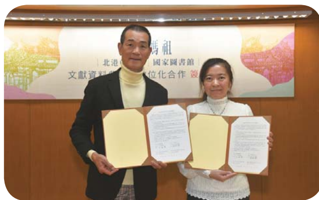
The National Central Library and the Chao-Tian Temple signed an MOU on digital collaboration

On March 8, the Chao-Tian Temple in Beigang and NCL formally signed an agreement to collaborate on digitizing and archiving documents. Both parties officially started working on their shared goal of establishing digital archives.