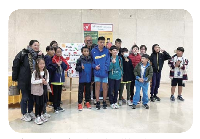
Students and teachers from the Affiliated Experimental Elementary School of University of Taipei came to enjoy the second film screened as part of the film festival: "Yuku and the Flower of the Himalayas"

The three-day French-language film festival took place from March 6th through 8th, including five films specially selected by the participating countries: "Sawah" (Luxembourg), "Yuku and the Flower of the Himalayas" (Yuku et la fleur de l'Himalaya, Belgium; Taiwan International Children's Film Festival international competition selection film), "My Very Own Circus" (Mon cirque à moi, Canada), "Home" (Switzerland), "ADN" (France). NCL invited people to learn about the diverse cultures of different French-speaking countries through these films, thereby expanding their international cultural perspectives and experiencing the rich and diverse cultural interpretations of French across different nations.