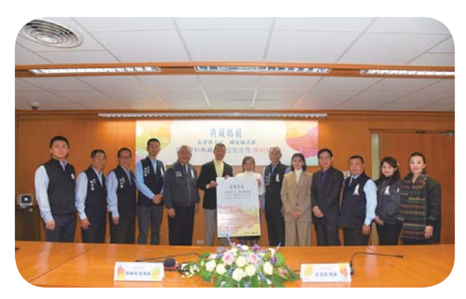
A group photo after the ceremony

By formally signing this agreement, both parties will begin the work of digitizing the rare documents held at the Chao-Tian Temple. The digital versions will be uploaded to NCL's Taiwan Memory platform, making them accessible to researchers and the general public alike. In the future, both parties will continue to promote various collaborations so that religious culture and research can be supported.