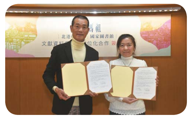
The National Central Library and the Chao-Tian Temple signed an MOU on digital collaboration

On March 8, the Chao-Tian Temple in Beigang and NCL formally signed an agreement to collaborate on digitizing and archiving documents. Both parties officially started working on their shared goal of establishing digital archives.