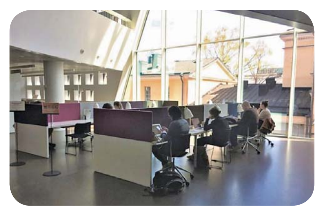
A corner of the University of Helsinki Library