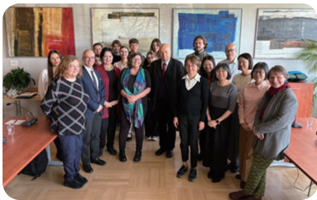
NCL and AMU collaborated to hold an international conference