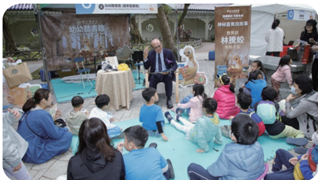
Administrative Deputy Minister Lin tells stories

After the launch ceremony, Administrative Deputy Minister Lin of the Ministry of Education and distinguished guests from all walks of life at home and abroad presented certificates of appreciation to the library community, organizations stationed in Taiwan, international librarians, government departments and museums, schools at all levels, publishing houses, co-organizing non-governmental organizations and foundations, expressing their gratitude to partners in various fields across the country who promote reading. Administrative Deputy Minister Lin then went to the "Happy Story Village" as a mysterious guest and told the stories of "Lost" (Faith in Friendship) and "The Cat Who Became a Librarian" (Appropriately International) to the children present, and the scene was filled with laughter.