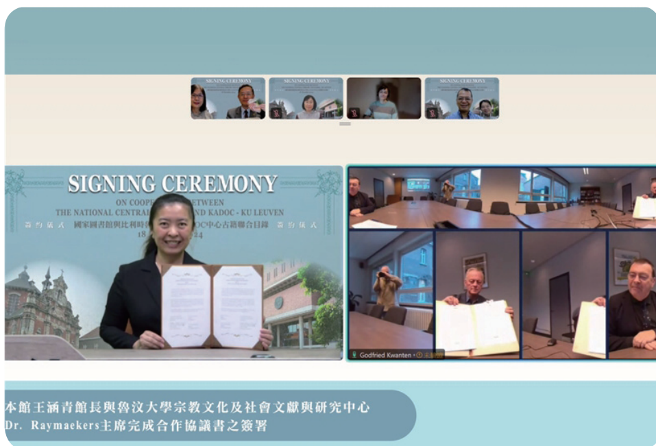
National Central Library and Belgium's KADOC, KU Leuven Sign Agreement of Cooperation on the Union Catalog of Rare Books Database