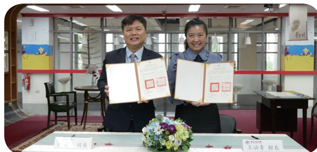
Director-General Wang and Rector Chen posing for a photo after signing the agreement

On October 8, 2024, the National Central Library and National Ilan University signed a collaboration agreement on the "Digitization of Historical Books and Archival Materials." Witnessed by faculty and students of Ilan University, this marked the first step in their partnership, aimed at promoting the digital preservation and dissemination of historical documents and books related to agricultural and forestry in Taiwan. This not only ensures the sustainable preservation of these national cultural assets but also highlights the critical role of digital technology in the preservation and transmission of historical records.