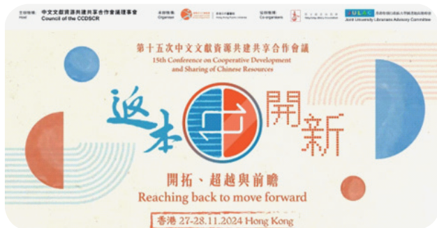
Visual Theme of the conference

The Conference on Collaborative Development and Sharing of Chinese Resources originated in 2000 as a collaborative platform initiated by scholars from libraries on both sides of the Taiwan Strait. Its purpose is to connect libraries and information institutions worldwide that house Chinese resources, fostering the collaborative development and sharing of these resources. To date, the conference has been held 14 times in various locations, including Beijing, Taiwan, Macau, Nanjing, Hong Kong, Dunhuang, and Lanzhou. Participants have represented regions and countries such as Mainland China, Hong Kong, Macau, Taiwan, Japan, Singapore, the United States, the United Kingdom, and the Netherlands. Since 2006, the conference has been held biennially.