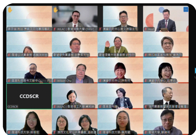
A group photo of attendees

Through the interdisciplinary dialogues facilitated by this conference, the exchange of experiences in the field of document preservation among Mainland China, Taiwan, Hong Kong, and Macau has been significantly enhanced. This collaboration offers positive contributions to the future direction of cultural asset protection and innovative applications, aligning with the conference's core theme, "Reaching Back to Move Forward." By balancing tradition and innovation, the event paved the way for groundbreaking advancements in cultural heritage preservation. For details regarding the conference, including the presented topics and participant information, please refer to the following webpage: https://www.hkpl.gov.hk/tc/extension-activities/ccdscr2024/Conference-booklet.html