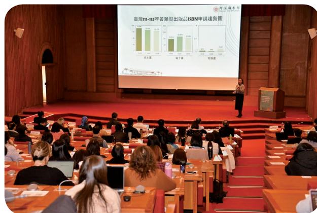
Director-General Han-ching Wang introduces the background and highlights of the system upgrade

Moreover, in addition to improving publishing and depositing efficiency, this system update also further enhances the accuracy of bibliographic information. In the future, when publishers deposit books, they will be able to make one-time corrections to bibliographic data by uploading updated book covers, descriptions, tables of contents, and other information. This ensures that the public can search for the latest and most accurate information on new publications, while also providing a more comprehensive space for showcasing new books.