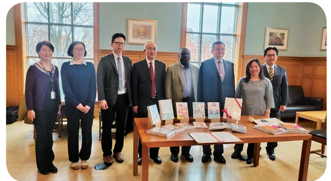
A group photo of the dignitaries in attendance

By participating in the Association for Asian Studies (AAS) book exhibition, Taiwan not only promoted its academic achievements but also brought important publications to Ohio, with the aim of deepening local understanding of the richness and diversity of Asian and Taiwanese humanities research, while providing valuable resources for scholarly reference and use.