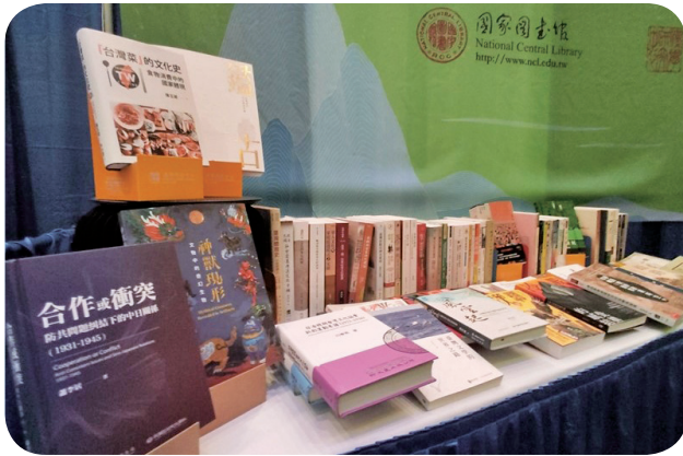
NCL shared research from Taiwan with the US and deepened international exchange