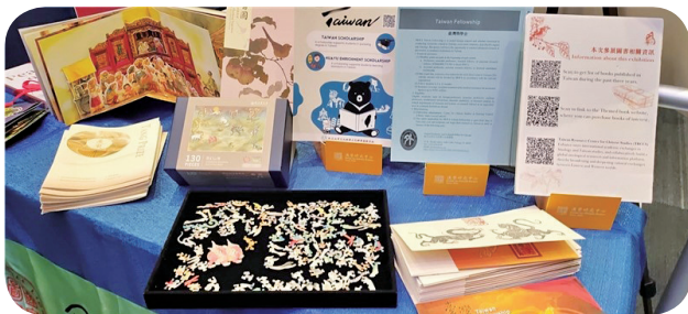
The exhibition had information on display for various types of stipends