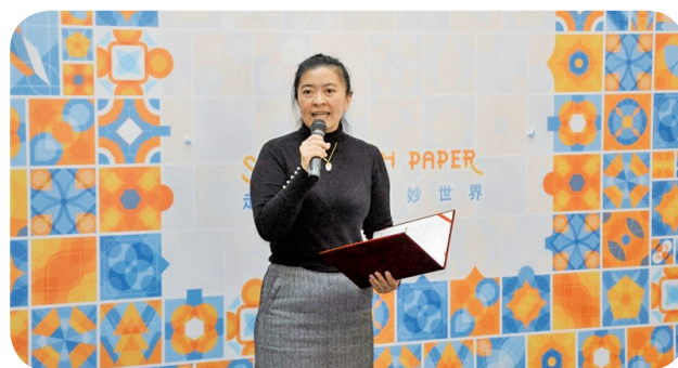
Director-General Han-ching Wang delivering her opening remarks

To explore the limitless possibilities of paper art, the National Central Library has curated the exhibition "It Begins with Paper: Entering the Wonderful World of Paper." The exhibition was held in the Reading Hall on the second floor and started with an opening ceremony on February 15, 2025, drawing numerous artists and cultural enthusiasts. The exhibition features five themed areas: "The Look of Paper," "The Subtraction of Paper," "Wandering Through Paper," "The Rise of Taiwanese Paper Art," and "Relief Dialogues." Each area presents a unique theme to showcase the diversity and creativity of paper art.