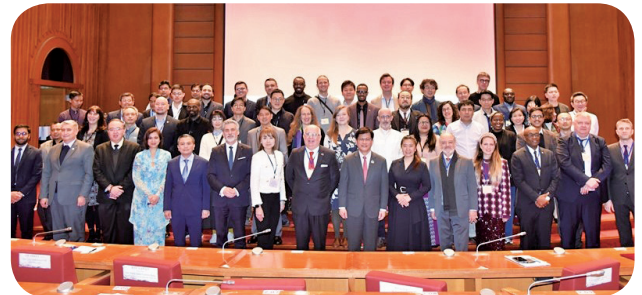
A photo of dignitaries in attendance

snacks—allowed international scholars to personally experience the atmosphere of Taiwan's Lunar New Year celebrations. The event also offered a variety of festive refreshments, including bubble tea, deep-fried glutinous rice balls, sweet potato balls, fried flour candy, candied peanuts, spiral cookies, crispy rice spirals, peanut confectionery, puffed rice treats, and smiling sesame cookie balls. The event was livestreamed via the Ministry of Foreign Affairs' Taiwan Academy Facebook page. Following the reception, Minister Lin was invited to visit the National Central Library's special exhibition "It Begins with Paper," which left a strong impression on him for its rich and evocative content.