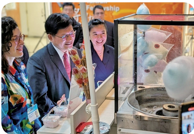
Cotton candy DIY area

In addition, this year NCL has completed a series of spatial renovations to provide scholars with a more comfortable research environment. Enhancements include private research carrels, scholar exchange spaces, and reading corners distributed throughout the library. With the planned completion of the NCL's Southern Branch in Tainan in 2026, NCL's services will be extended to southern Taiwan, with the hope of attracting researchers to undertake residency-based research in the region. Minister of Foreign Affairs Chia-lung Lin, who since taking office has actively supported the Taiwan Fellowship program, extended New Year greetings to the international scholars present. He also encouraged them to make the most of their time in Taiwan by forging friendships, experiencing the warmth of Taiwanese hospitality, sampling local cuisine, gaining a deeper understanding of Taiwan's landscape and culture, and enjoying the unique way of life this land has to offer.