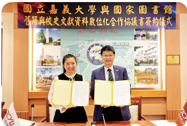
The signed collaboration agreement