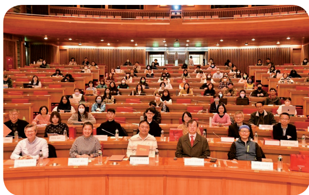
A group photo of publishing representatives in attendance at the press conference

The innovative measures highlighted in this press conference will not only facilitate smoother operation of publishing processes, but will also strengthen the application value of book information. This will advance deep collaboration between Taiwan's publishing and library sectors. Furthermore, this infrastructure enhancement will also further expedite the circulation of knowledge, strongly propelling an overall enhancement of reading ability among Taiwan's public and moving toward a vision of prosperity for the future of Taiwan's publishing industry.